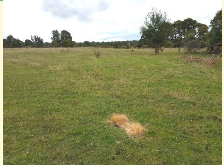
Serrated tussock plants treated with selective herbicide

Further information is available from http://bit.ly/serratedtussock or by contacting Council's Land and Natural Resources Coordinator on 1300 366 244.