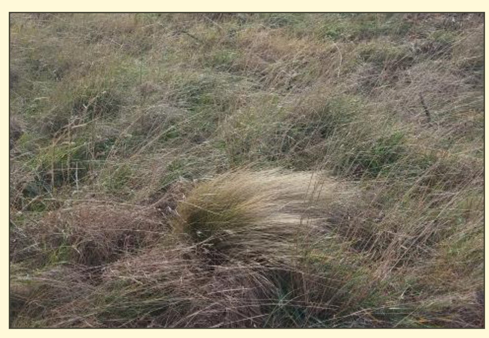
A large mature serrated tussock plant discovered and later treated on crown land during recent inspections at Riddells Creek, Victoria