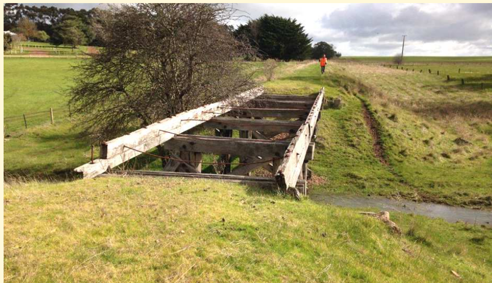
VicTrack officers inspect the linear reserve for serrated tussock