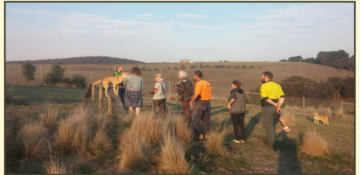
Some of the workshop attendees share some time with the Dingos.

More information on the Dingo Foundation can be found at: http://www.dingofoundation.org/sanctuary.php