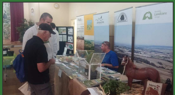
The live specimens of serrated tussock and native tussock proved popular once again.