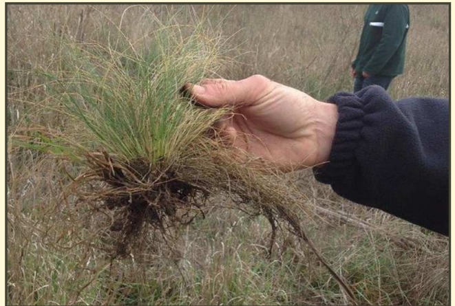
A small serrated tussock plant removed during the seasonal inspection by VicTrack staff and contractors.

VicTrack aims to lead by example, engaging contractors to monitor for the appearance of serrated tussock and carry-out follow-up treatments when required in the VSTWP target areas.