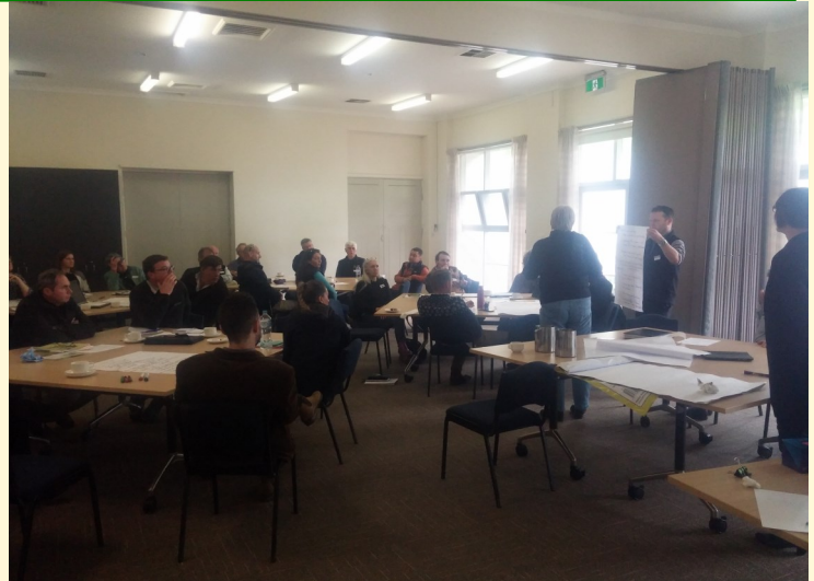
Stakeholders discussing the best ways to collaborate on renewing action in the core region.