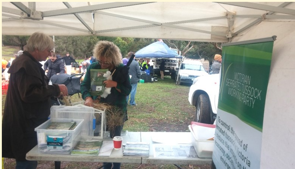
Landowners learn the finer points of identification at Bellbrae